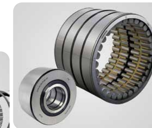
Four-row cylindrical roller bearing