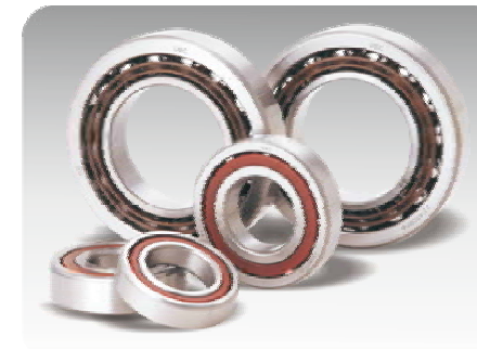
High precision angular contact ball bearings