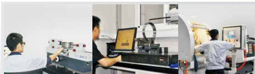
Frequency of Inspection