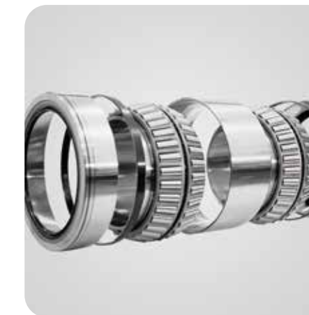
Four-row tapered roller bearing