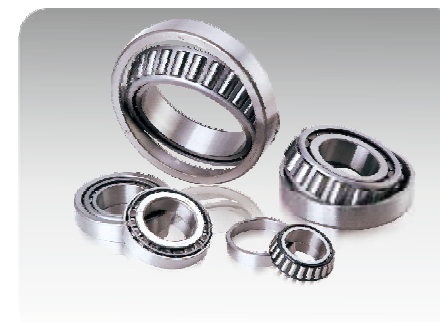
Tapered roller bearings (metric & inch design)