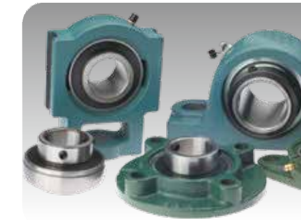
Bearing units & bearing inserts