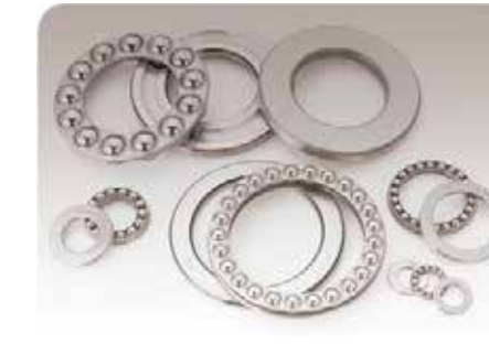
Thrust ball bearings