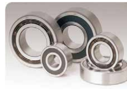
Customized ball bearings for electric motors (EMQ5)