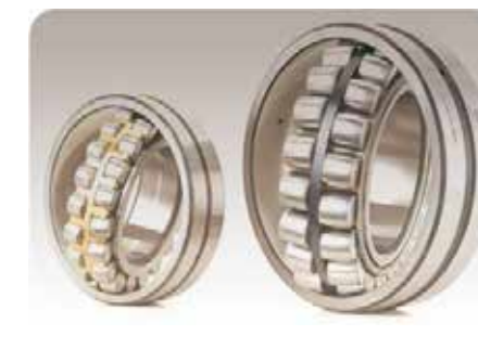
Spherical roller bearings