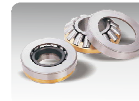
Thrust spherical roller bearings