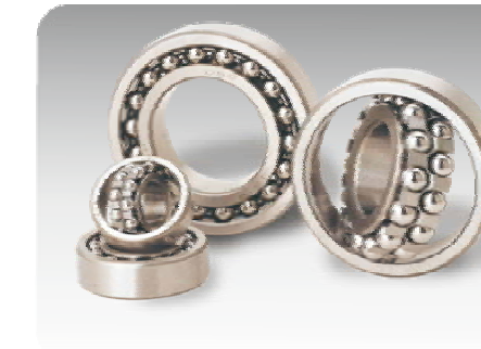
Self-aligning ball bearings