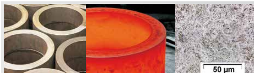
Material Selection Heat Treatment Process Control