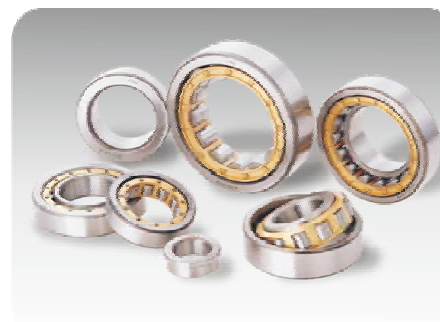
Cylindrical roller bearings