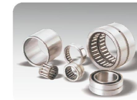
Needle roller bearings