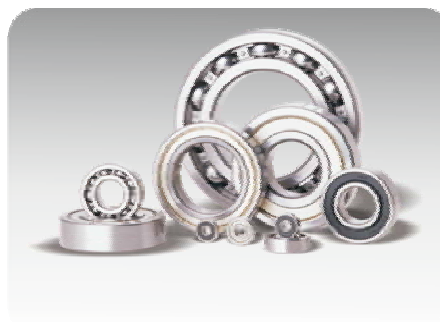
Deep groove ball bearings